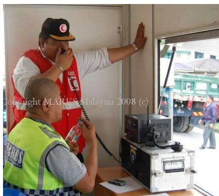
Radio amateur providing communication support to MRCS during