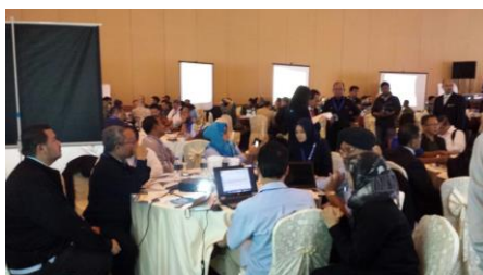
ARF-DiREX 2015 table top exercise

13. Presented "MARES: Radio Amateur & Radio Astronomy" at National Islamic Astronomy Symposium 2009 at International Islamic University Malaysia on 31st Jan 2009.