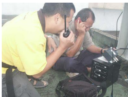
MARES Repeater Setup