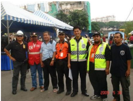
Operating Comm. Center during Dec 2008 Bukit Antarabangsa landslide

In September 2009 MARES assisted JPAM and provided communication support during a SAR operation to find 2 missing jungle trackers at Broga hill near Semenyih. Both trackers were eventually found.