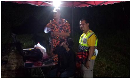
Operating Comm. Center during 2014 Ops Cessna Plane Crash at Ulu Yam