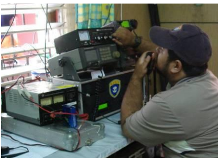
Supporting communication needs during Dec 2006 Johor flood.

In February 2002 Malaysian Red Crescent requested us to provide an Emergency Communication link from Kuantan to their headquarters in Jalan Nipah Kuala Lumpur during the flood Relief Operation in Pahang.