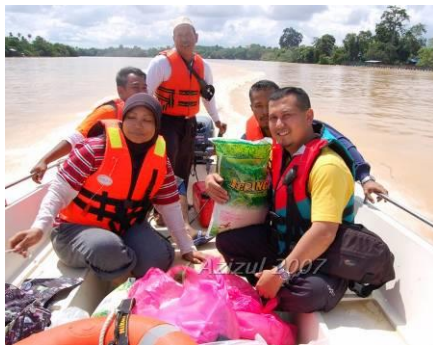
Delivering food supplies during Dec 2007 Pahang flood.