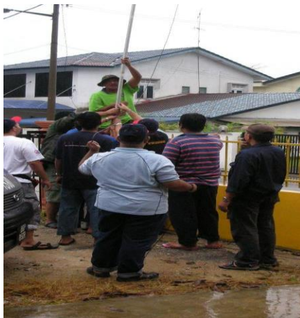
Setting up a radio antenna during Dec