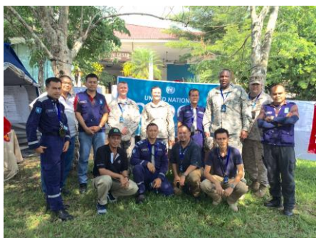
ARF-DiREX 2015 with UN OCHA and SMART Team