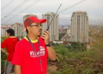
Providing communication support to MPPJ during 2005 PJ Challenge.