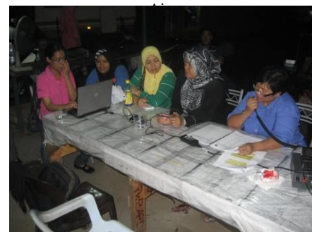
Ladies radio amateurs conducting 2m Net from MARES club house.