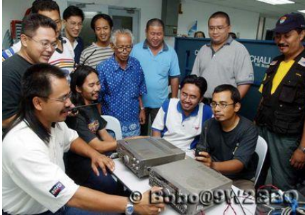
Radio Amateur Examination (RAE) preparation class by MARES.