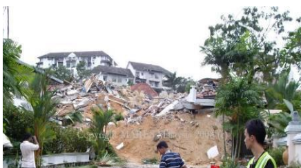
Dec 2008 Bukit Antarabangsa Landslide.