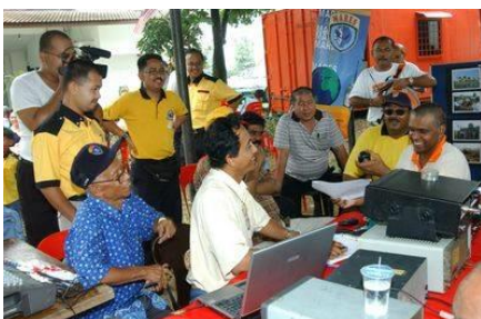
MARES field-day event