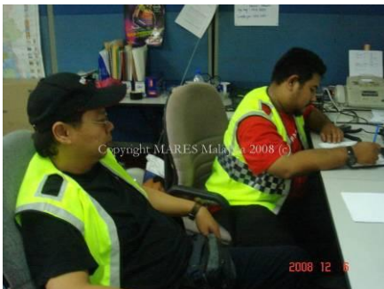
MARES Command Center during a disaster operation

Thus far MARES is the leading non-governmental organization that provides emergency communication to various government agencies in Malaysia. Our operations and functions share many similarities with Amateur Radio Emergency Service (ARES) in the United States of America, Radio Amateur Emergency Network (RAYNET) in the United Kingdom and Wireless Institute of Civil Emergency Network in Australia (WICEN).