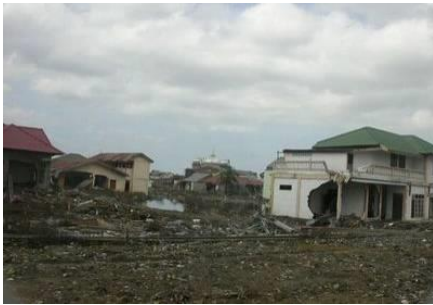
Acheh Dec 2004 Tsunami