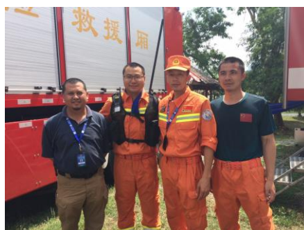
ARF-DiREX 2015 with team China

17. Malaysian Observer at Asian Regional Forum – Disaster Relief Exercise 2015 (ARF-DiREX 2015). MARES played advisory role to SKMM during the exercise. ARF-DiREX 2015 was co-hosted by the Malaysian and Chinese government with 27 countries participating in a large scale exercise involving sea, air, land and table top simulation.