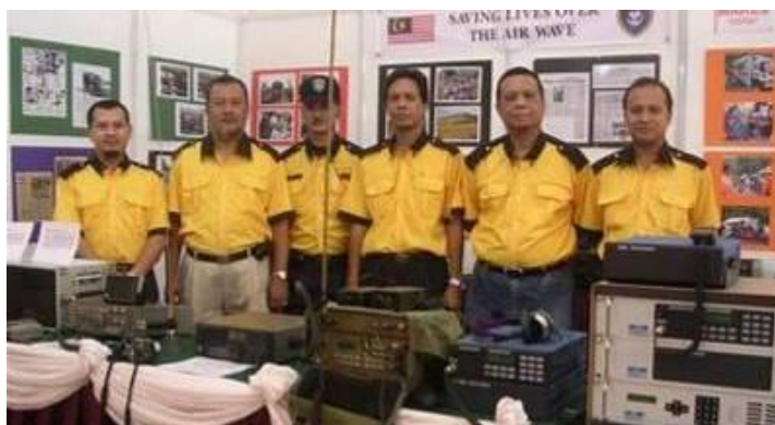
MARES promotes amateur radio and emergency communication to public.