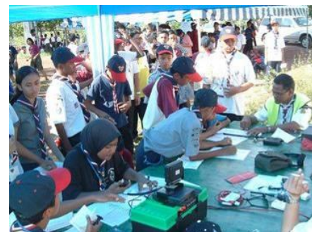
Radio amateurs operating radio stations at the annual scouts Jamboree-On-The-