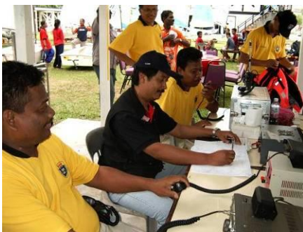
MARES on-site radio station

MARES is the abbreviation for Malaysian Amateur Radio Emergency Service, a registered non governmental organization, established in 2002 as a result of the need to have a team of dedicated and well trained radio operators to assist the authorities in times of emergency and disaster. As such, we specialize in radio communications for emergency and disaster relief operation. We can operate at various frequencies, use various communication modes such as PSK31, RTTY, morse code, and SSTV, and can communicate in analog or digital. We also provide communication assistance for certain social events such as sports and fund raising campaign.