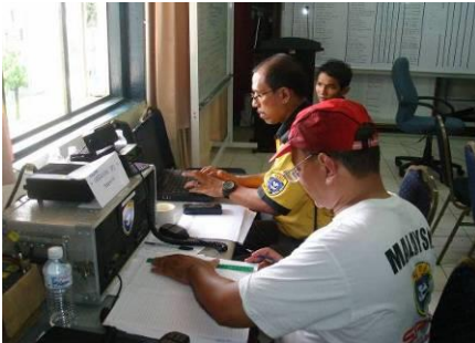
Communication support during Feb 2002 Pahang flood.

Most of MARES members have been actively involved in emergency communications to support disaster and relief missions in Malaysia. In 1967 a big flood hit Kota Bahru Kelantan knocking down telecommunication network. Radio amateurs were called in to provide emergency communications for the disaster area; and also to link Kota Bharu with Kuala Lumpur.