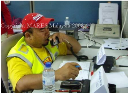
Operating Comm. Center during Dec 2008 Bukit Antarabangsa landslide