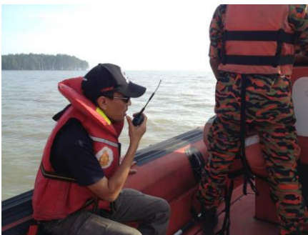
MARES member on SAR team boat providing up to date information to 2014 Ops Kelanang Command Center

MARES was contacted by Selangor Fire & Rescue Department (FRD) to provide emergency communication in support of the search and rescue operation conducted on a capsized boat carrying 97 passengers off Banting waters. As the appointed coordinator for radio hams emcomm support for FRD's RESCAR, MARES had broadcasted through all communication means calling for volunteers to assist the SAR agencies.