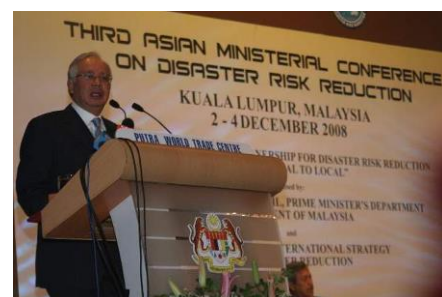
3rd Asian Ministerial Conference on Disaster Risk Reduction – Dec 2008

The following is a list of various events and conferences which we have participated.