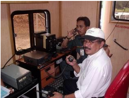
Operating the Command Center during Mar 2005 Klang Gates Dam plane crash.

In 1994 fire broke out at Subang International Airport. Radio amateurs were requested by the Department of Civil Aviation to provide back up communication for the failed Airport Terminal Information Service (ATIS) system.