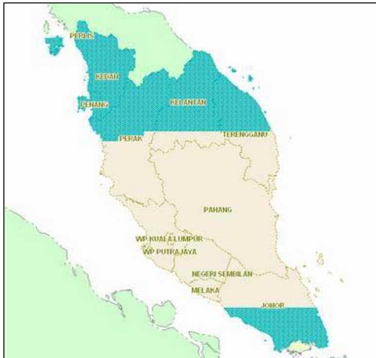
Map 1 (West Malaysia): Areas of coordination with Thailand & Singapore. ■ = areas need to be coordinated